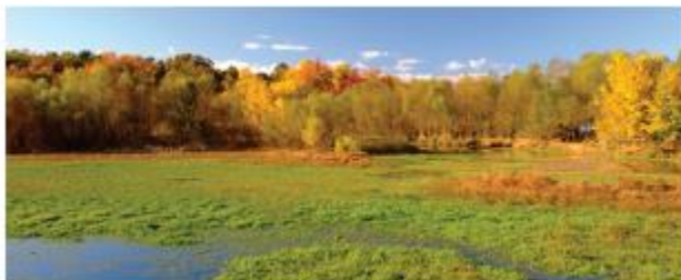
Lake Conestee Nature Preserve

E. coli levels rise and make the river unsafe for contact immediately after a rain. E. coli is discharged to the river from wild animals and pets, overland flow, malfunctioning septic tanks, leaky private sewer service laterals, and sanitary sewer overflows (SSOs).