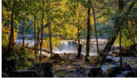
The Reedy River at Cedar Falls